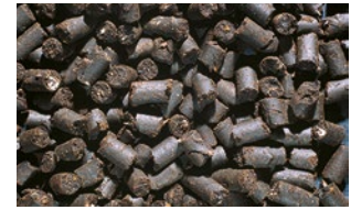
Pelleted compost with NPK