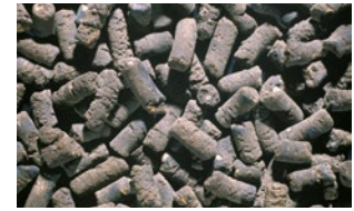
Dried pelleted compost with NPK