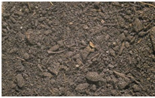
Compost with NPK