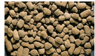
Sprayed and coated compost pellets